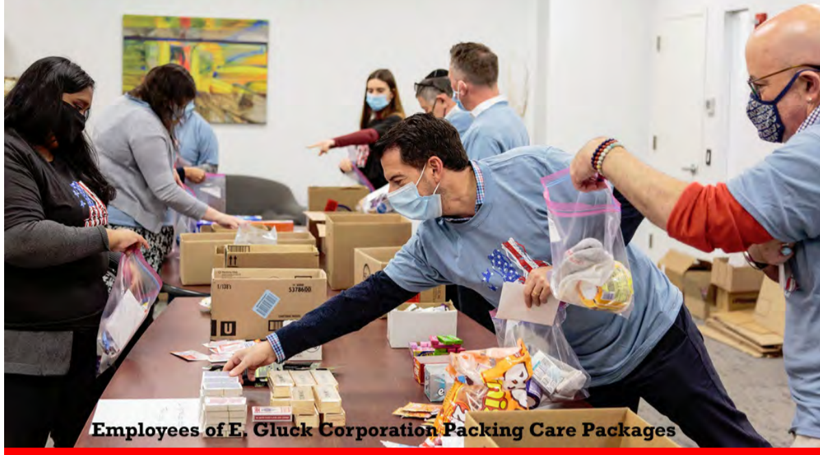
Employees of E. Gluck Corporation Packing Care Packages